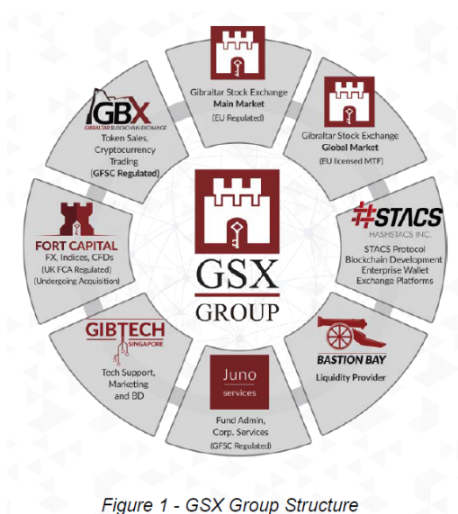
Figure 1 - GSX Group Structure

105 As can be seen from the illustration of the various divisions of the GSX Group, H Inc was to be responsible for “STACS Protocol”, “Blockchain Development”, “Enterprise Wallet”, and “Exchange Platforms” 54 whereas GBX was responsible for token sales and cryptocurrency trading.